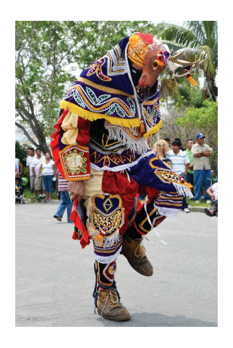
Some dancers dance as deer,